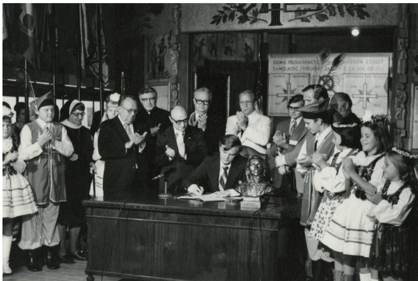
Illinois Governor Daniel Walker signing the Pulaski Day bill at the Polish Museum of America, September 9, 1973. From the PMA Photography Archives Collections

Danuta Inglot Polish Resistance AK Foundation