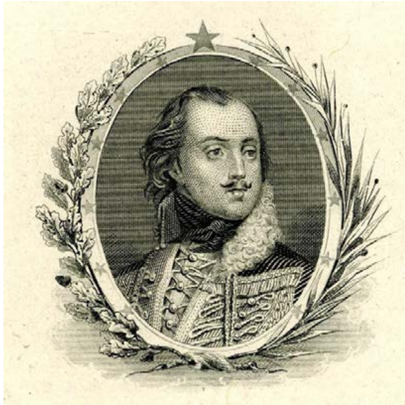
General Casimir Pulaski (1745-1779)